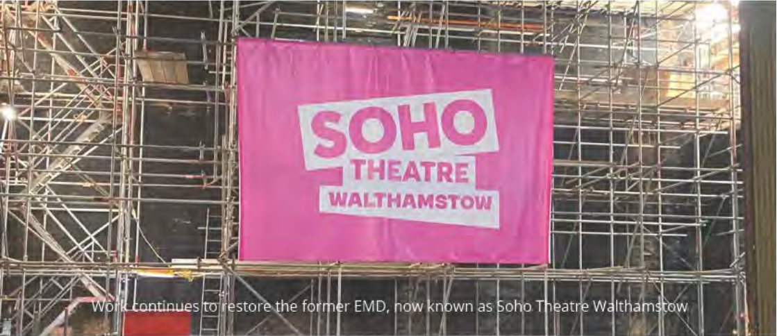
Work continues to restore the former EMD, now known as Soho Theatre Walthamstow