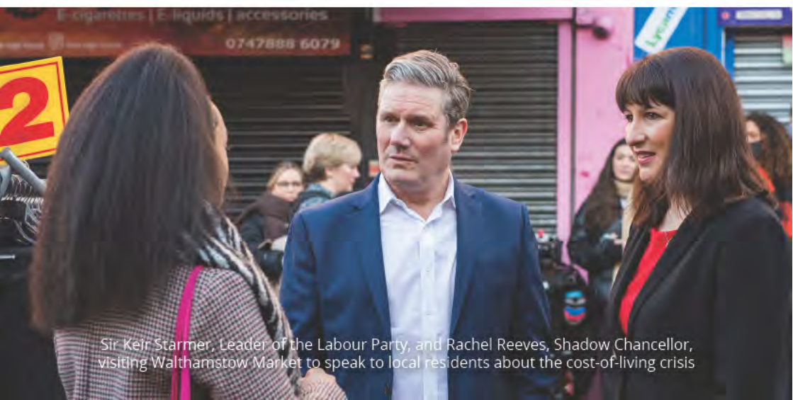
Sir Keir Starmer, Leader of the Labour Party, and Rachel Reeves, Shadow Chancellor, visiting Walthamstow Market to speak to local residents about the cost-of-living crisis