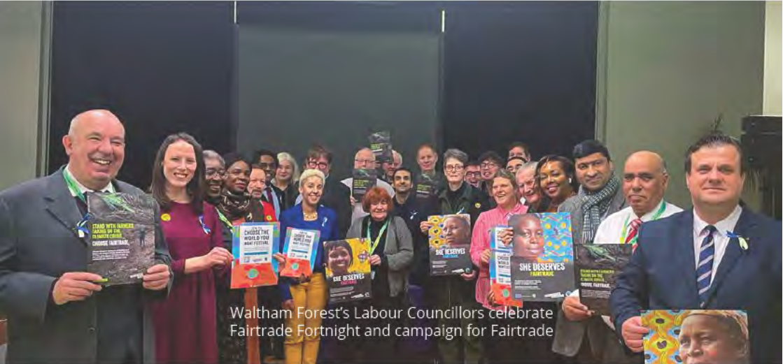
Waltham Forest's Labour Councillors celebrate Fairtrade Fortnight and campaign for Fairtrade